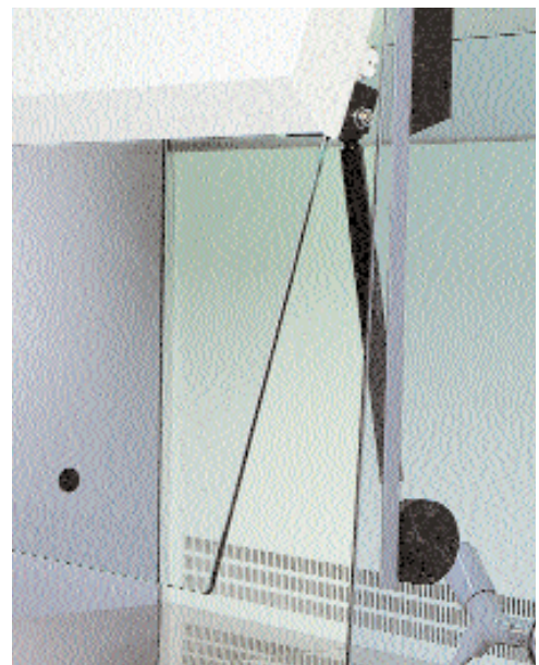
Front door in tempered glass with gas springs