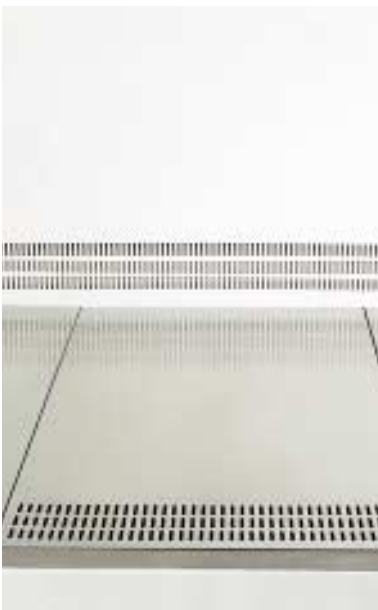
Working table in stainless steel. Easy to clean

-Quality Control Certification for every equipment with test results according to International Standards.